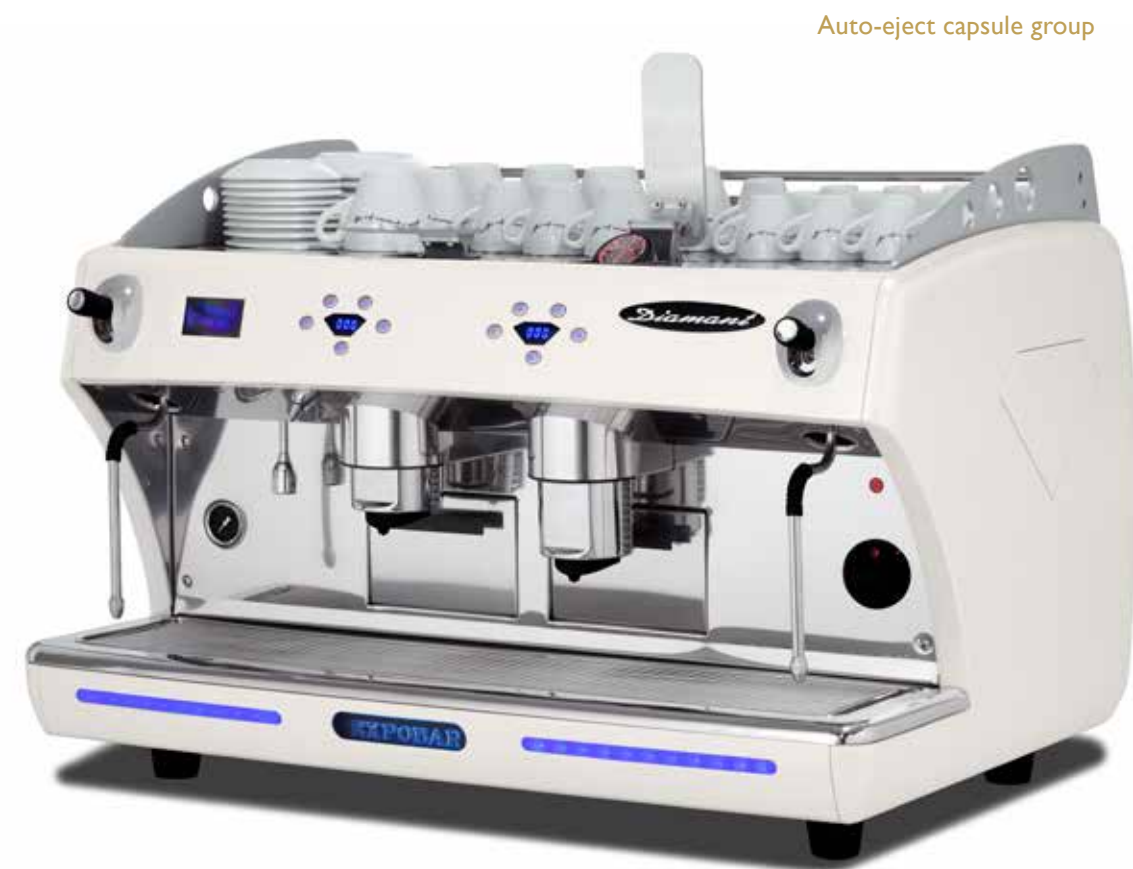
Auto-eject capsule group